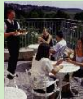
Drinks on the Terrace

With so much to see and do on our doorstep, the Grange Hotel is the ideal location for those who wish to experience the magic and beauty of the Lakes in comfort and style.