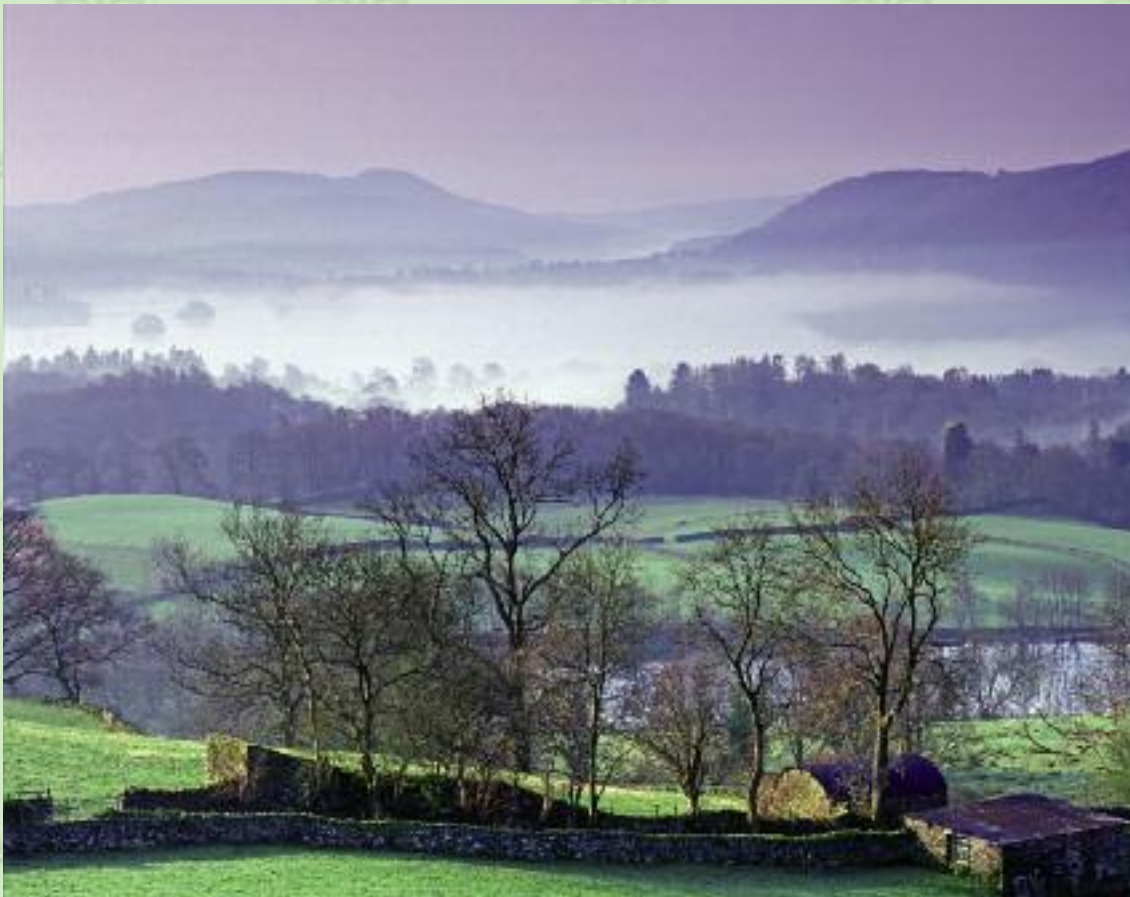
Windermere from Trout Beck

Some of the world's finest scenery – on our doorstep