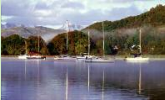
Autumn at Waterhead