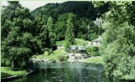
Grange Ornamental Gardens