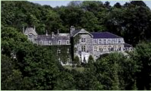
The Grange Hotel